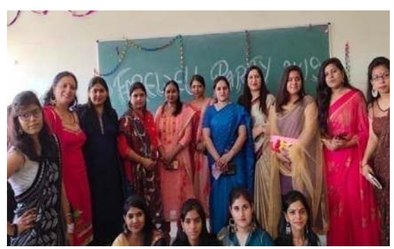
Farewell function of Computer Engg. Branch