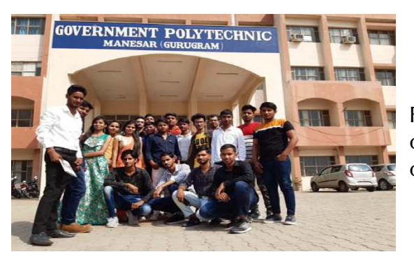
Farewell function of Civil Engg. Branch on 03, April