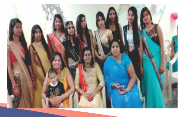
Farewell function in Girls Hostel